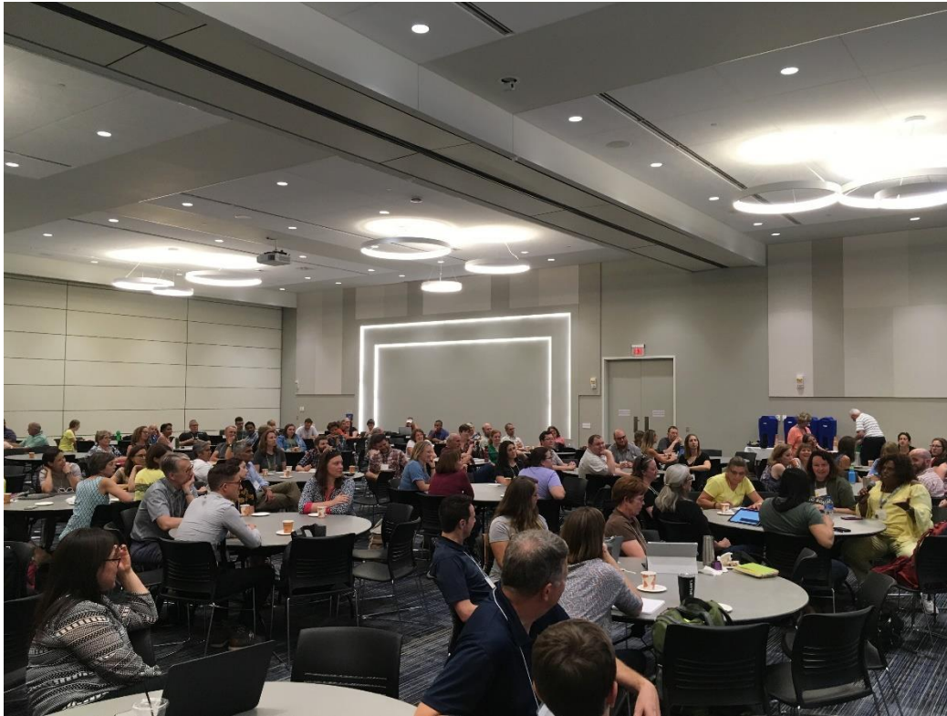
TED EER session participants. July 2018.

TED decided to represent for the first time at the Earth Educator Rendezvous 2018 in Lawrence, Kansas, and it was a total success! We decided to engage in three ways: provide travel stipends, sponsor the meal break before a session, and distribute division swag.