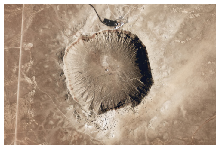
Figure 1: Satellite image of Barringer or Meteor Crater, Arizona U.S.A. The dark rectangle at the top is a museum.

As terrible as these impacts were, none of them left craters. According to the Earth Impact Database (PASSC, 2015), there are almost 200 verified craters on Earth's surface from even bigger impacts, almost none of which occurred during recorded human history. Oddly, most of them were not identified as impact structures until the late 20<sup>th</sup> century. Geologists generally attribute features like craters and canyons to events we can see taking place today or in recorded history, like erosion by rivers, gradual movement of rocks on either side of a fault by earthquakes over time, volcanic eruptions, etc. Craters