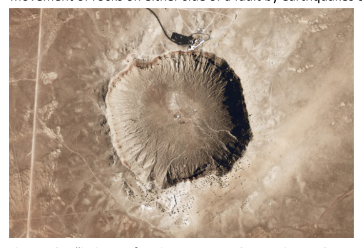
Figure 1: Satellite image of Barringer or Meteor Crater, Arizona U.S.A. The dark rectangle at the top is a museum. (http://earthobservatory.nasa.gov/IOTD/view.php?id=39769)

As terrible as these impacts were, none of them left craters. According to the Earth Impact Database (PASSC, 2015), there are almost 200 verified craters on Earth's surface from even bigger impacts, almost none of which occurred during recorded human history. Oddly, most of them were not identified as impact structures until the late 20<sup>th</sup> century. Geologists generally attribute features like craters and canyons to events we can see taking place today or in recorded history, like erosion by rivers, gradual movement of rocks on either side of a fault by earthquakes over time, volcanic eruptions, etc. Craters