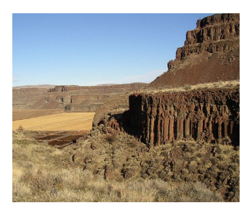
Figure 2: Three Devils Grade on the Columbia River Plateau (public domain).

One feature they share is that the minerals that make up continental flood basalts have an unusual