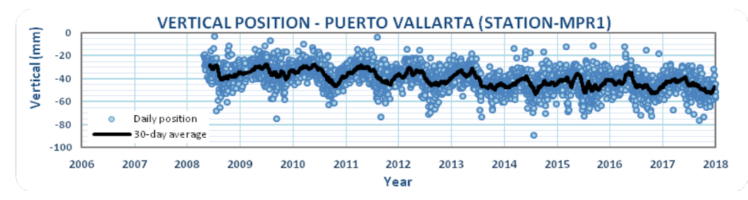
Figure 1. Vertical GPS data from station MRP1 in Puerto Vallarta, Mexico, from the beginning of January 2006 to the end of December 2017.

When I, as a scientist, look at data, I begin by determining what the graph is showing and then make observations by describing the trends.