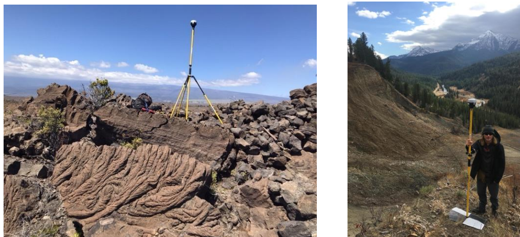
Figure 1. An example of a Real-Time Kinematic (RTK) base station (left) and rover (right). Many options are available for rover mounts including poles, bipods, and backpacks (shown). A PPK setup is essentially the same, minus the radio link.

carrier code correction and base position to the roving antenna and receiver unit via radio. The rover receiver combines the base station data and a GNSS positioning signal from satellites. The receiver compares the variations and noise in the base station's code with its own, which allows it to eliminate several sources of error including atmospheric and tropospheric delays, integer ambiguity guesses, and clock errors. The correction of these errors increases the accuracy of the rover's position from tens of centimeters to 1–2 cm precision. Although RTK systems have many advantages, they require significantly more equipment in the form of two radios, batteries, and supporting equipment.