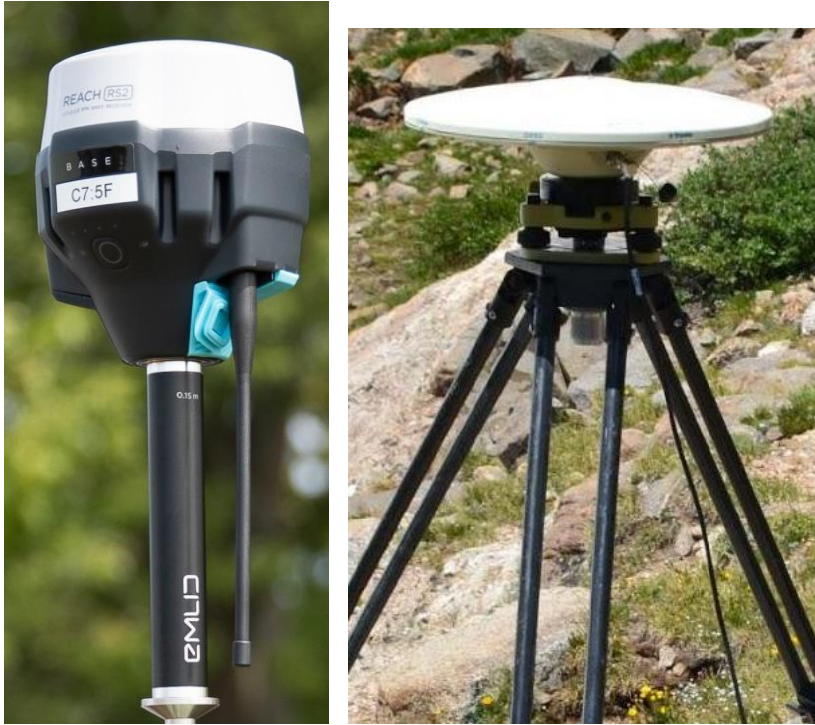
Figure 2: (Left) Emlid Reach RS2 antenna/receiver combination. It contains a LoRa radio and is designed to be self-contained. (Right) Trimble Zephyr geodetic antenna mounted on a tribrach and connected to an external receiver via a port on the bottom of the saucer.