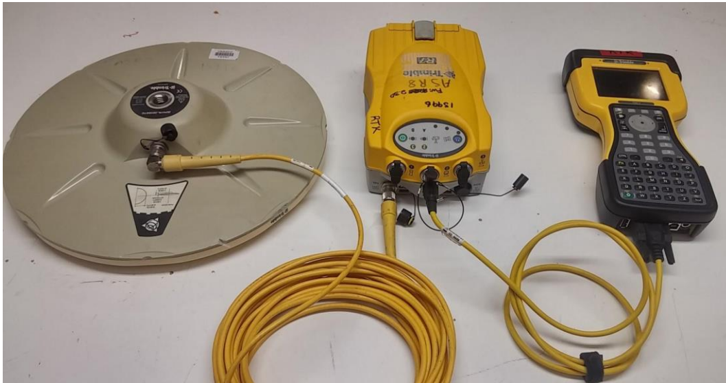
Figure 6. An example of the main components on a PPK or RTK rover. Trimble Zephyr antenna, R7 receiver, and controller. The RTK set up would also include a radio antenna attached to the R7.