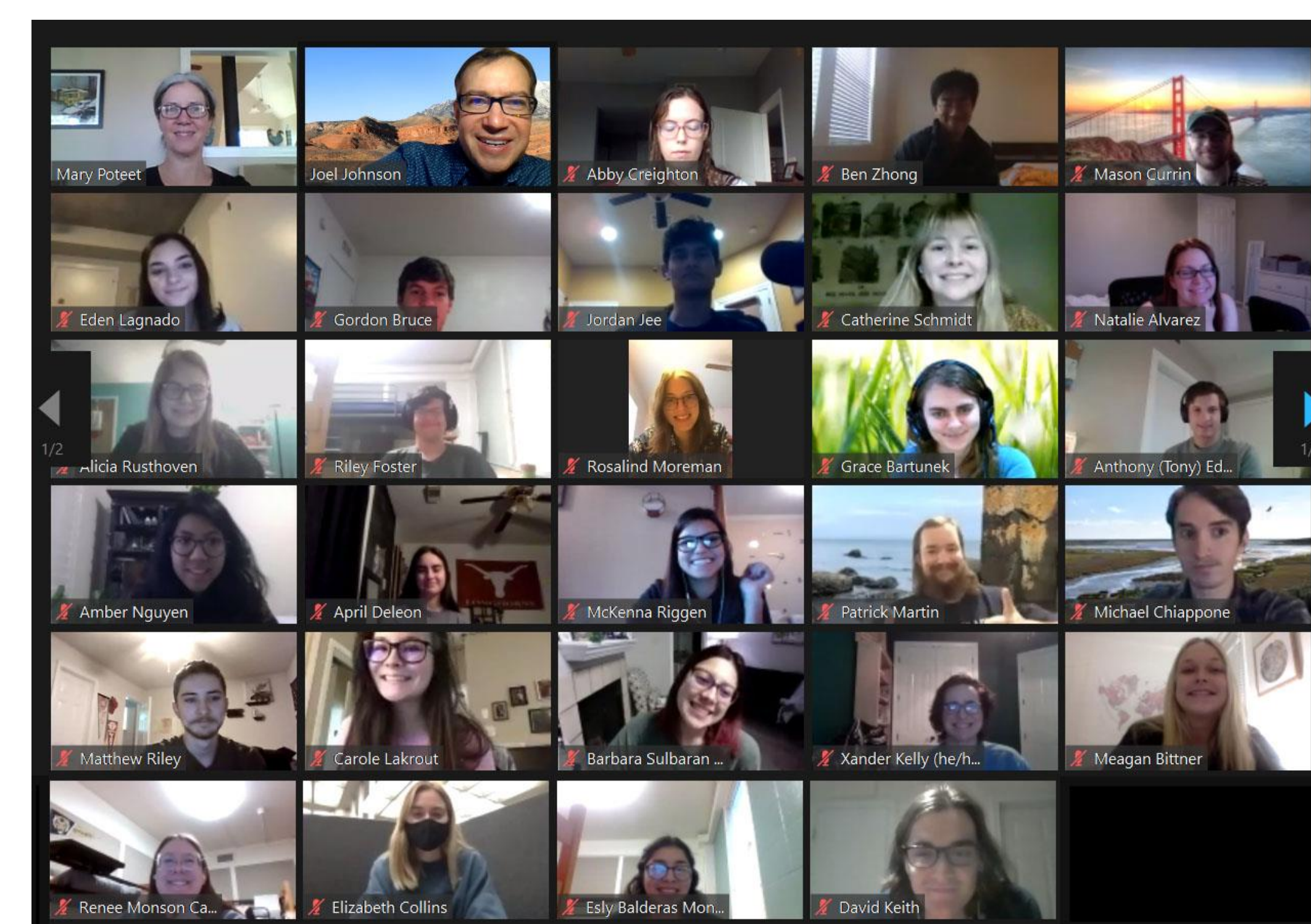
Jackson Scholars from UT Austin who will form the first peer learning community with 2YC students