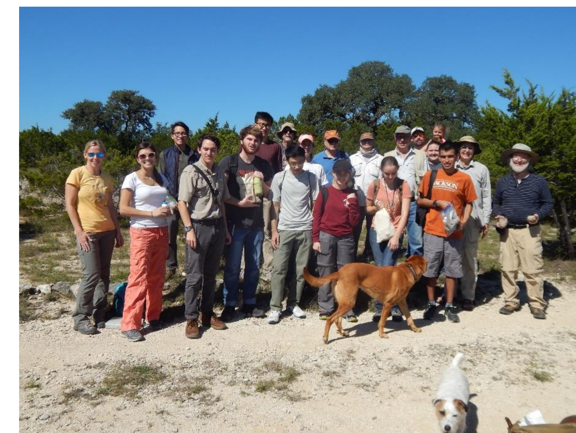
Collaborative field trip with undergraduates from ACC and UTA