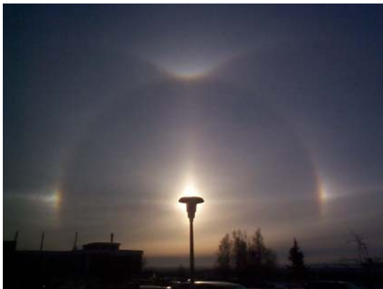
Fairbanks halo display.

The Atmospheric Science Program at the University of Alaska Fairbanks is composed of an expanding group of energetic young faculty. We share a common interest in the physical, chemical, and dynamical processes of the polar atmosphere. Our interests cover a broad spectrum of topics in the atmospheric science, with research results often bearing directly on society and issues surrounding climate variability and change. Many of us also maintain research interests in other regions of the globe.