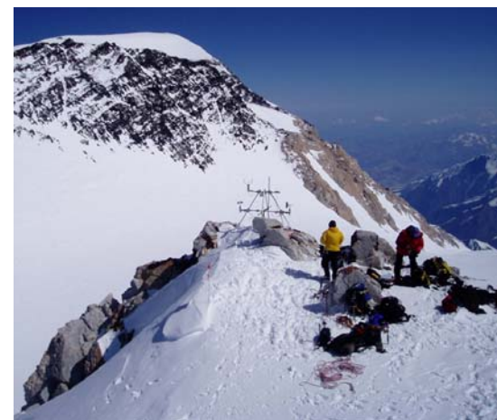
Servicing the UAF/IARC weather station on Mt. McKinley (just below the summit at 18,700 feet). Photo by Tohru Saito (IARC), members of the Japan Alpine Club assisting.