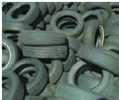
Students research tire disposal landfills (above).