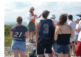
Geology Service Learning classes and field experiences actively involve students in research to investigate questions of interest. Funding from NSF, OBR, ITL, Office of Student Development.