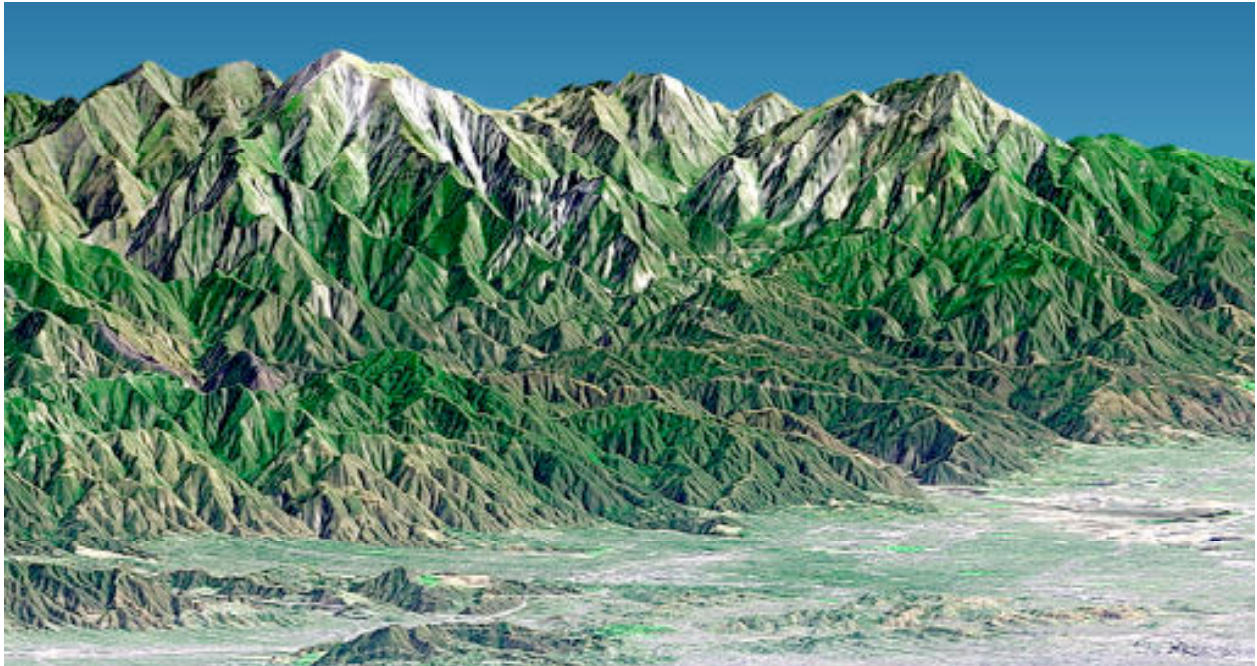
Digital Elevation Model (DEM) of the central San Gabriel Mountains, Los Angeles County, California. (Modified from NASA Shuttle Radar Topography Mission (SRTM) Image PIA 03332)

GSC 323 – Geomorphology Geological Sciences Department Cal Poly Pomona University