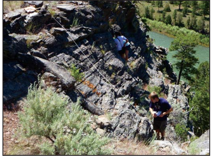
Figure 10. Students acquire the ability to appropriately use tools in the field setting as they encounter the genuine complexity of the environments they must selectively measure.

Actual tool use is subordinate to the analytic decision-making process that leads, for example, the field worker to choose to make a map of this but not that (and related decisions about map scale, choices of rock units, style of mapping), to measure the strike and dip of a particular rock because it will provide relevant information that may not be evident in other nearby rocks, or selection of samples for future analysis. The hands using the