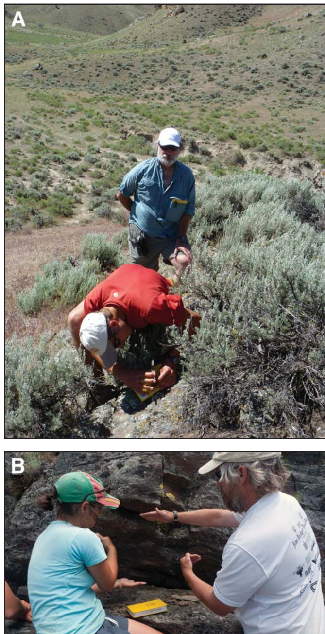
Figure 9. (A) Embodied practice demonstrated as a student collects structural data under the guidance of a senior geologist. The instructor simultaneously is interacting with the student, monitoring the activity, and interacting with the natural environment that he is observing. (B) The use of gesture by a senior geologist to draw attention to structures on the outcrop, and through movement, to demonstrate deformational processes.

The importance of the embodied cognitive activities that occur in the field before an inscription is even produced points toward a crucial time dimension in field learning that requires much more systematic investigation. In the field, students do not simply make maps, or carry out a traverse, but constantly circle back, for example, repetitively looking at the landscape, drawing a representation, looking back at the landscape to check what they've drawn, making revisions to the drawing, moving to a different position to get a different view, etc. (For examples of the traces of student navigation in field mapping exercises as recorded by GPS, see Riggs et al., 2009a, 2009b.) Such embodied looking, gesturing, and moving through space is central to not only producing maps and other inscriptions, but also to knowing how to understand the inscriptions produced by others. In our opinion, an important future research agenda for understanding field learning is videotaping actual processes of making inscriptions and related field activities, so that the crucial embodied, and linguistic, events that occur on this moment-by-moment time scale, and that seem central to the formation of both competence and knowledge in the earth sciences, can be adequately