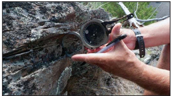
Figure 11. Use of tools in the field (e.g., Brunton compass) requires knowledge of how to use the instrument itself, and knowing where to make measurements, why this measurement should be made, and how it will be applied.

tools are tied to a mind that is learning to see and think as a geologist through the actual work of deciding what parts of the landscape to describe, measure, or sample and thus to return from the field with analytically relevant representations of what they saw there (Fig. 11).