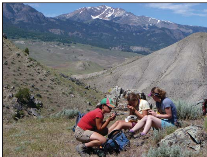
Figure 2. In the field setting, the scale of the study is typically large relative to the observer, on the scale of meters to kilometers, as contrasted with the micron- to centimeter-scale objects studied in the laboratory.

The field setting allows students to make their own informed decisions about what to observe, for what purpose, how to represent these observations, and how to interpret and ascribe meaning to their work. In contrast, when students learn from derivative representations or preselected sample collections, someone else has already done the critical work of deciding what is important. Thus, the student does not experience the full cascade of representations of nature from the simplest and most direct types (e.g., pictures, sketches) derived from the most local, concrete, and material examples to the more abstract and mathematized representations (Latour, 1987; Lynch, 1990; Roth, 1996). In a school laboratory, most objects on the laboratory table are