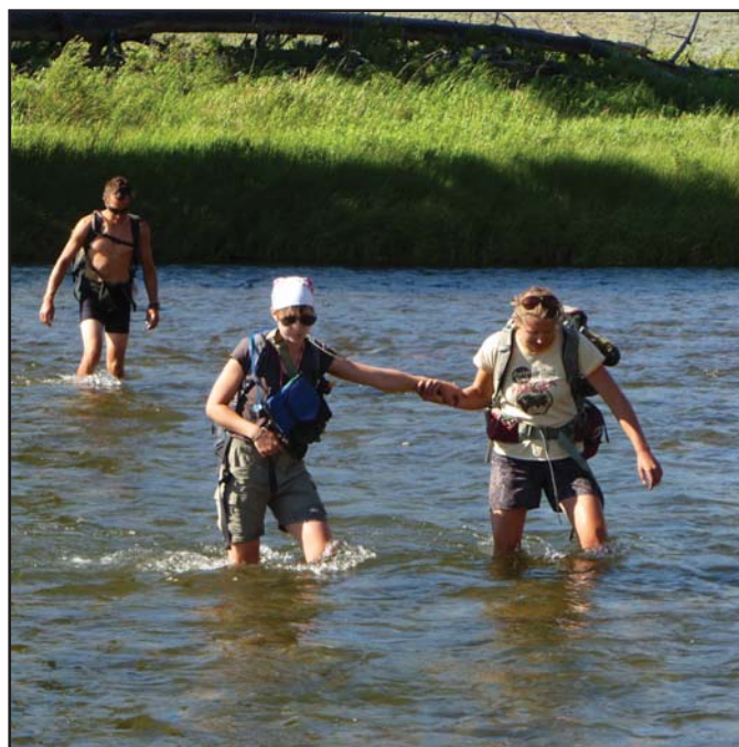
Figure 5. The field setting induces strong affective responses. These include creation of an interactive social learning environment that can develop social and professional networks that may last a lifetime. Unique or unusual experiences in the field can commit information to long-term memory that can be retrieved for future use.

The field setting provides an important interactive social learning environment, and the strong emotions that are engendered by field experiences deliver cognitive responses that are unique with respect to other learning environments (Kempa and Orion, 1996; Alsop and Watts, 2000, 2003; Marques et al., 2003; Fuller et al., 2006; Fig. 5). Shared experiences in the field form the basis for strong social and professional networks that may last a lifetime. These networks may be between student and mentor or peer to peer. Mentoring by master geoscientists plays many roles: stimulating interest and motivation to learn through their enthusiasm and knowledge base about the assigned tasks; assisting students in their own professional development by presenting