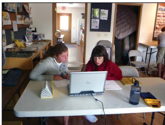
Figure 4. Students at a field camp compiling data collected in the field. Structural data plotted on a stereonet and maps of geochemical sample locations were used to inform future field mapping and sampling activities.