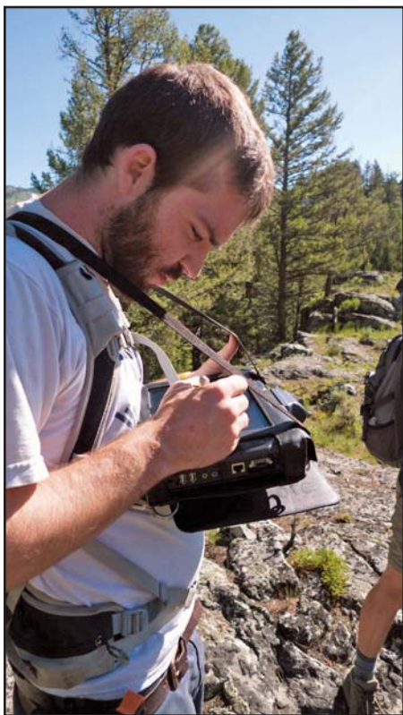
Figure 12. An example of using information technologies in the field. Will this be the new professional standard for fieldwork? How does this technology impact learning in the field?