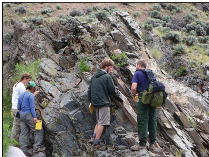
Figure 3. Learning in the field provides a continuum of instructional experiences that emphasizes inquiry and discovery, requires application of knowledge and skills from across the geoscience curriculum, and provides opportunities for students to develop critical-thinking and problem-solving skills. In this setting, students are applying knowledge learned in the classroom to characterize and measure preserved sedimentary structures that can lead to an interpretation of the environment of deposition. Their physical position in the outcrop allows them to explore the spatial relations of the outcrop while simultaneously directing the attention of their peers to features of interest on the outcrop.

A geologic map represents the melding of field observations with various types of analytical data and earth science concepts. ... Some would claim that in the mapping process, theory meets reality. However, a map is a more subjective product based on the sum of the geologist's prior training, aggregate field experience, and the stage of development of scientific concepts, the complexity of the mapped units, the extent and quality of exposures, the wealth of constraining ancillary data, and the time and thought expended in the mapping.