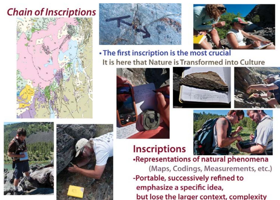
Figure 7. Inscriptions of natural phenomena transform observations of nature into permanent, portable records. Inscriptions represent distilled nature, and purposefully emphasize specific observations while excluding other information. The first inscription is the most crucial, because this is where informed decisions are made about what is important to record, and what is not.

Scholars investigating scientific practice, in a continuing line of research extending from work such as Latour and Woolgar (1979), have demonstrated that the documents through which scientific knowledge is codified and disseminated, such as journal articles and conference presentations, are systematically produced through a process that involves skilled work with tools that transform the subject being investigated by a particular scientific discipline into appropriate, tractable graphic representations. The different kinds of graphic representations used by scientists are sometimes glossed as "inscriptions," a term meant to encompass representations as diverse as preliminary maps, graphs of numerical data, images from microscopes and other scientific instruments, the overheads used in talks, the enhanced graphic displays used as figures in journal articles, animations, 3-D visualizations, etc. (Fig. 7). Inscriptions are necessarily simplified representations of the real world; they "... do not simply 'reveal' facts about the world, but rather simultaneously obscure many aspects of