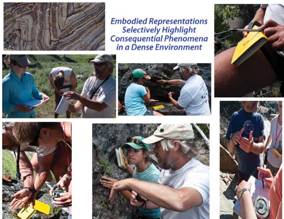
Figure 6. Embodied representations of natural phenomena, using gestures, notebooks, and folded paper to demonstrate physical features in the outcrop to students.

Figure 6 provides a number of examples of gesturing hands, combined with materials such as notebooks and pieces of paper that can model planes and folds. The gestures and materials are being used to represent for students critical geological structures that are present within the dense landscape being scrutinized, but that are difficult for an untrained eye to selectively see. Students’ bodies, positioned in the midst of the field setting, take into account simultaneously both the complex Earth that they are trying to study, and the transient representations artfully constructed through the embodied activities of their professor that selectively highlight consequential structure. Through this process, the students are guided to develop the professional vision required to be a competent geoscientist. As will be discussed in more detail later herein, the practices required to construct and work with maps